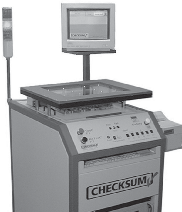
Typical Model TR-9-1000-QC Performing Test

The Model TR-9 can be used for test fixturing of circuit boards up to 13.2" x 16". This fixture system can be used for most general-purpose bed-of-nails fixturing applications including those with top and bottom access, and TestJet Technology*.