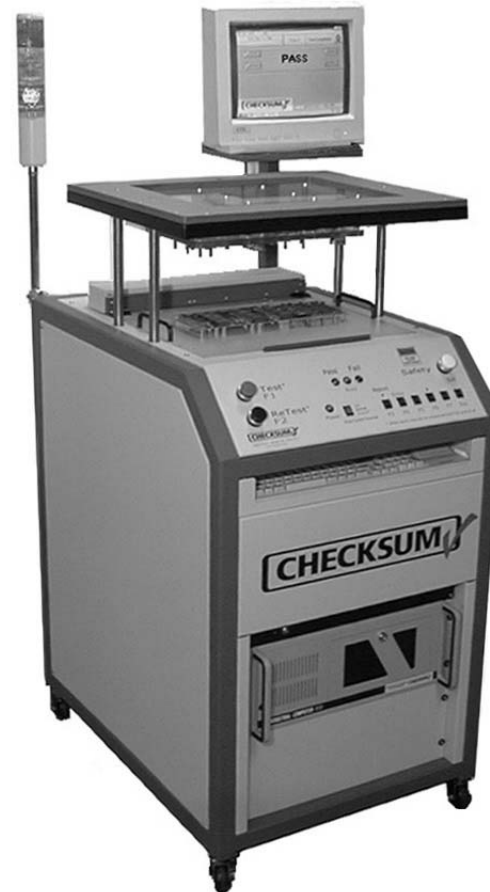
Typical Model TR-9-1000-QC in UUT-Loading Position